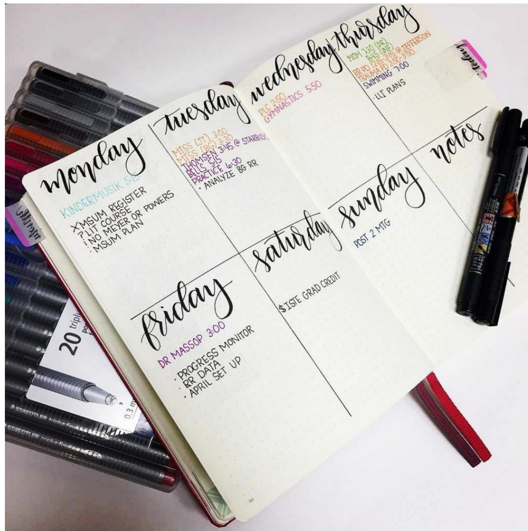
Weekly spread, Bullet Journal example